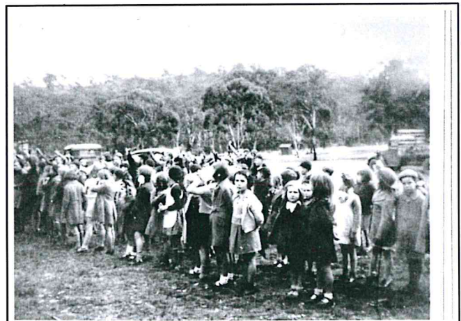
School children from Clare Primary School present at the Arbor Day planting of the memorial trees at the Showground, September 1939